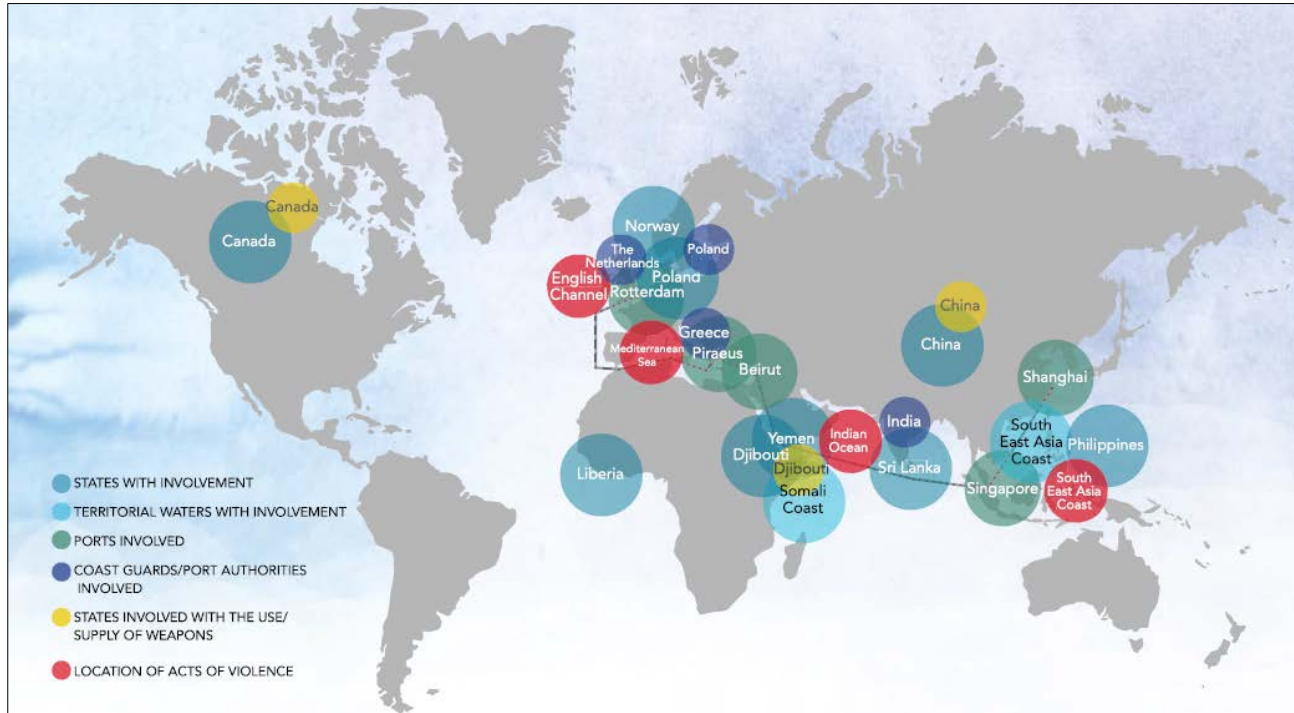
Illustration: Bulk carrier sailing from Shanghai to Rotterdam, 12,000 nautical miles, 5 ports